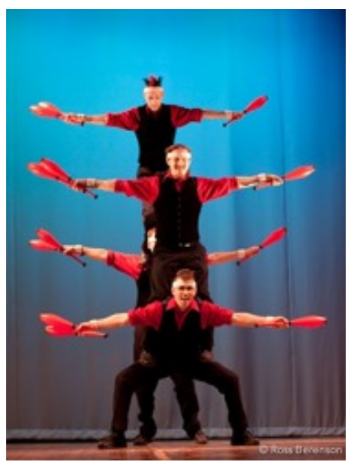
A Different Spin