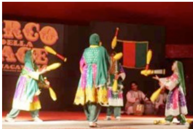
Mobile Mini Circus for Children : Afghanistan