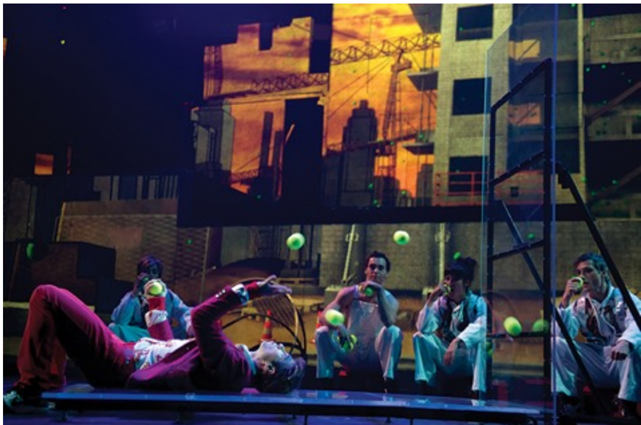
© 2010. Théâtre T et Cie/Valérie Remise

If you can't see iD in person, don't miss the videos linked below!