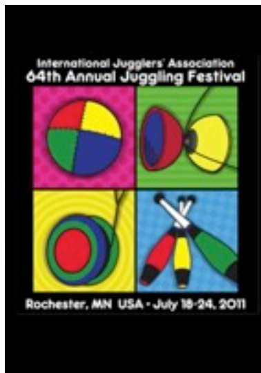
Rochester 2011 2-DVD set Member Price: $30.00 IJA Store