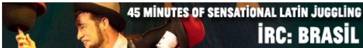
IRC Brazil Full 45 Minute Video