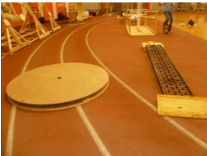
Turntable and Conveyor Slide