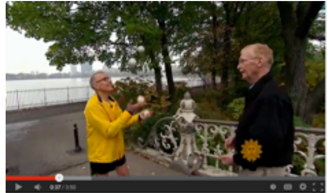
Juggling on CBS News Sunday Morning 11/11/2012