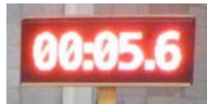
Electronic Laser Timing

The Gauntlet was made possible by the iiWii Fun Fund and a whole lot of time and energy supplied by the volunteers who built it.