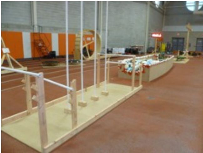
Foam Pit and Under/Over