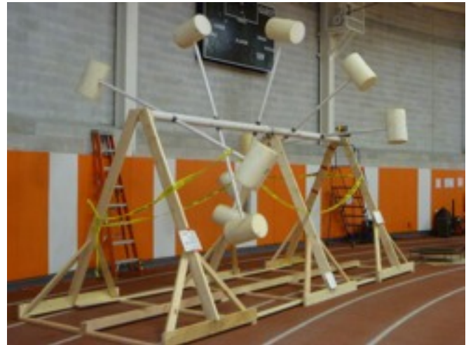
Rotating Mallet Field