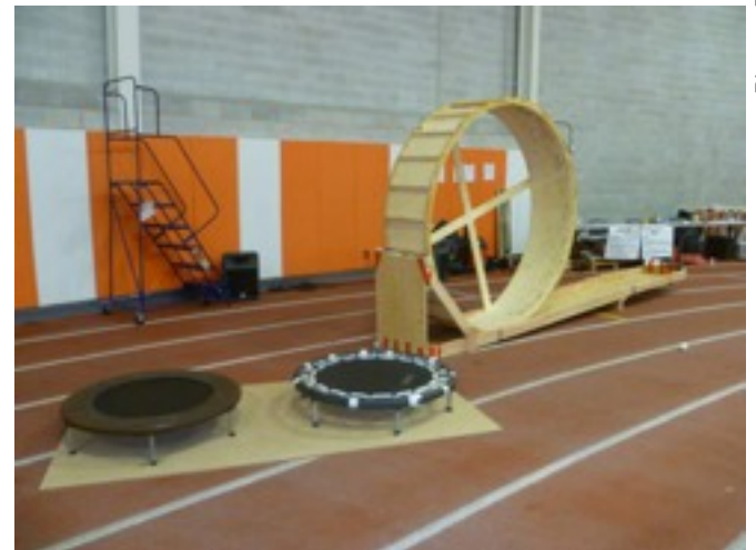
Trampoline Field and Hamster Wheel