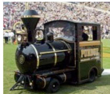
The Purdue mascot is the Boilermaker

Come join us for the 2014 IJA Festival, July 28 - August 3, at Purdue University, West Lafayette, Indiana!