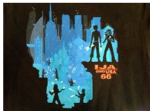
back of shirt