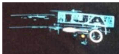
front of shirt

http://www.juggle.org/store/index.php?main_page=index&cPath=4