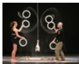
Institute of Juggology