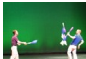
Duck and Cover