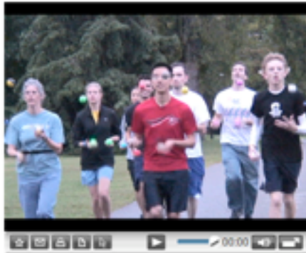
Team Catch It Early has a unique approach to raising awareness about breast cancer

Check out Team "Catch It Early" as they juggle to raise money for cancer research. They recently had 15 jugglers participating in a race, something not usually seen outside an IJA festival!