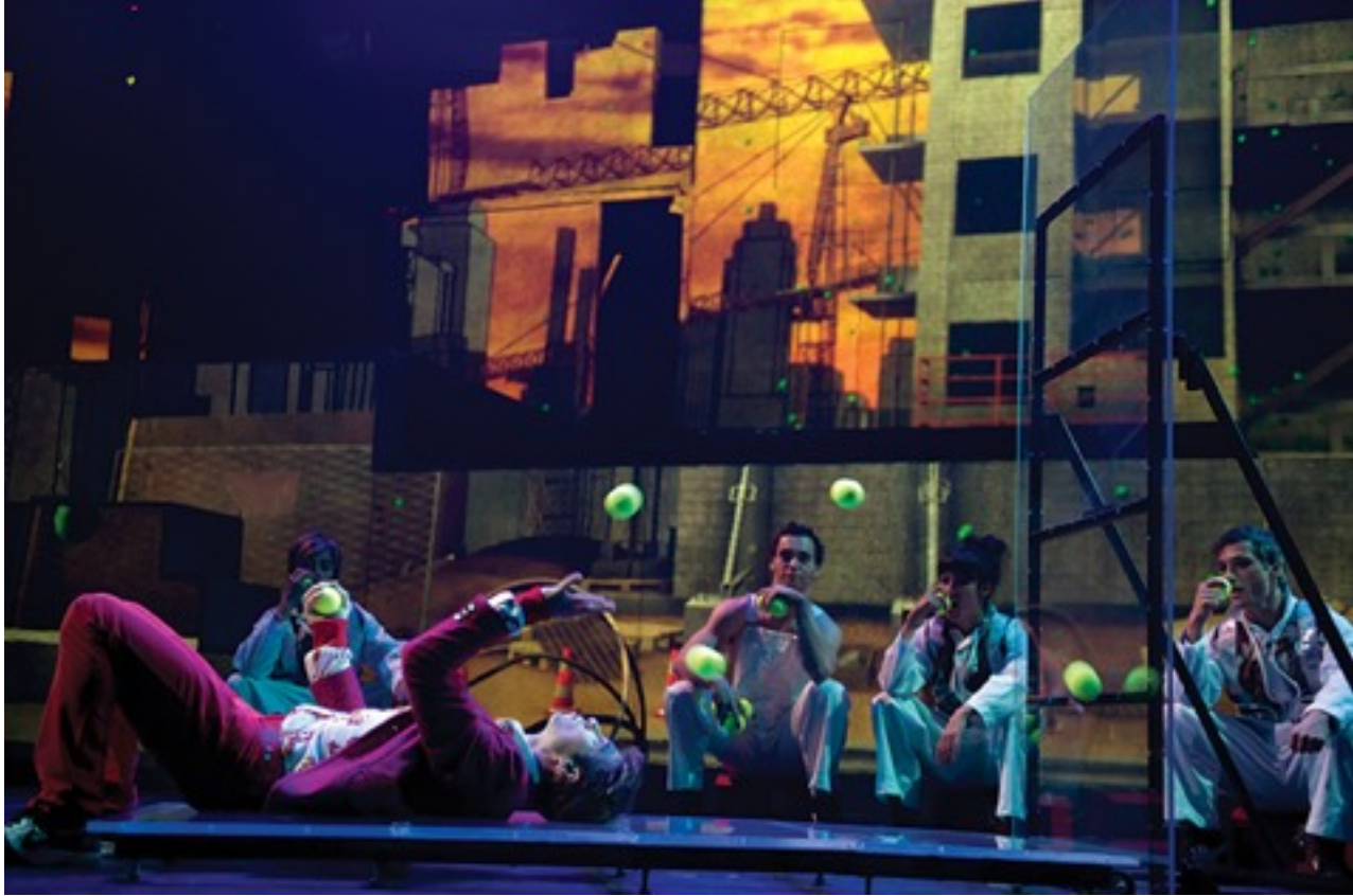
http://www.cirque-eloize.com/en/shows/id http://www.cirque-eloize.com/en/shows/id/press-review http://www.youtube.com/watch?v=WPrh5wEJqLs http://www.youtube.com/watch?v=cKFXPbNXQgk

If you can't see iD in person, don't miss the videos linked below!