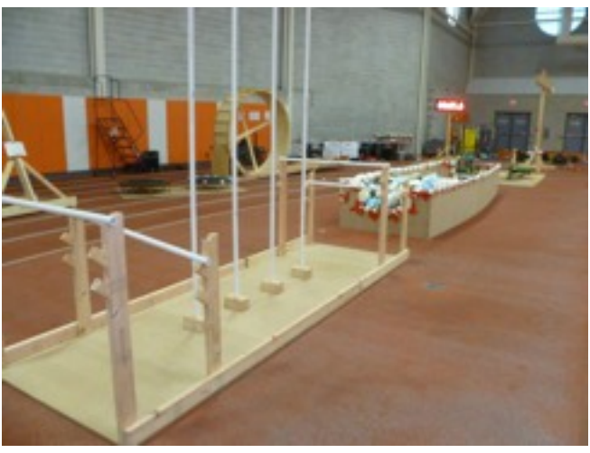
Foam Pit and Under/Over