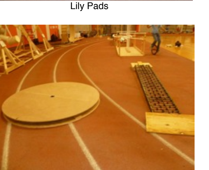
Turntable and Conveyor Slide