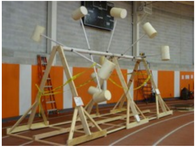
Rotating Mallet Field