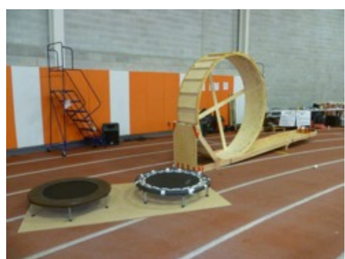
Trampoline Field and Hamster Wheel