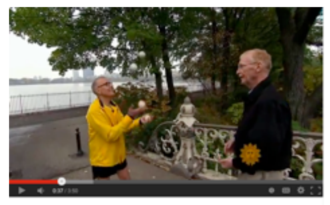
Joggling on CBS News Sunday Morning 11/11/2012