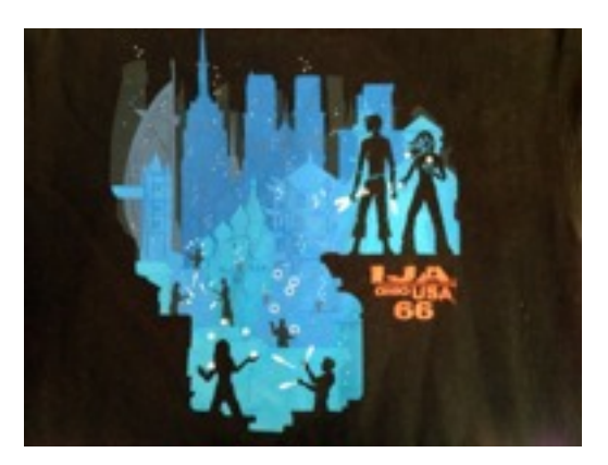
back of shirt