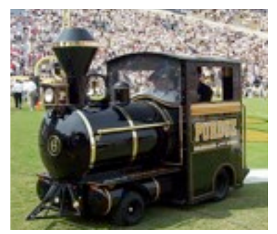
The Purdue mascot is the Boilermaker

Come join us for the 2014 IJA Festival, July 28 - August 3, at Purdue University, West Lafayette, Indiana!